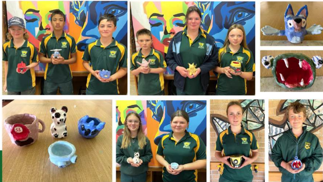
Year 7 Visual Arts

Last term Year 7 learnt about Ceramics and the pinch pot technique. Students were asked to create a character or monster using their established knowledge and skill.