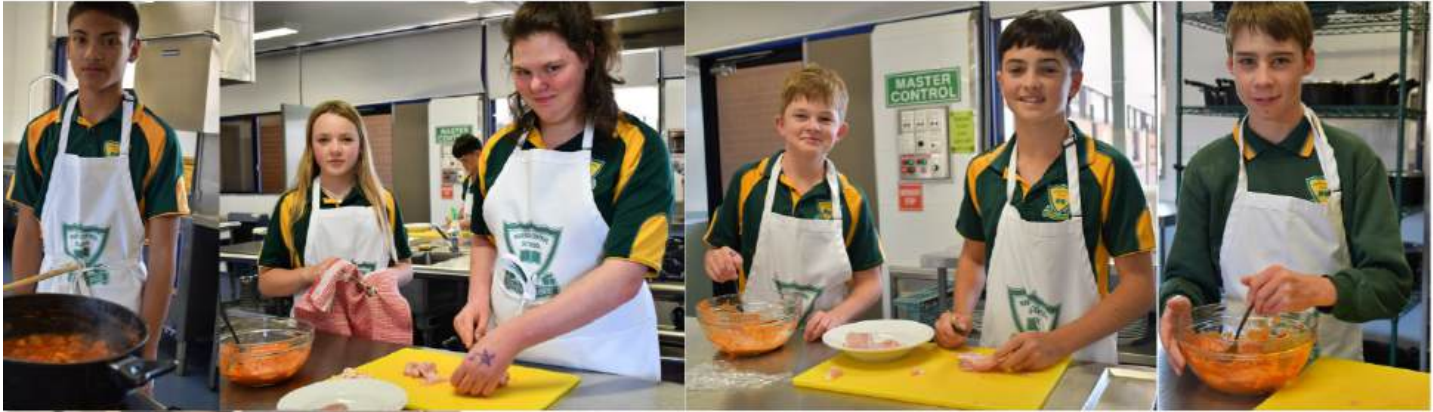
In Year 7 they prepared butter chicken and rice in the kitchen, and the delightful aroma was simply incredible.