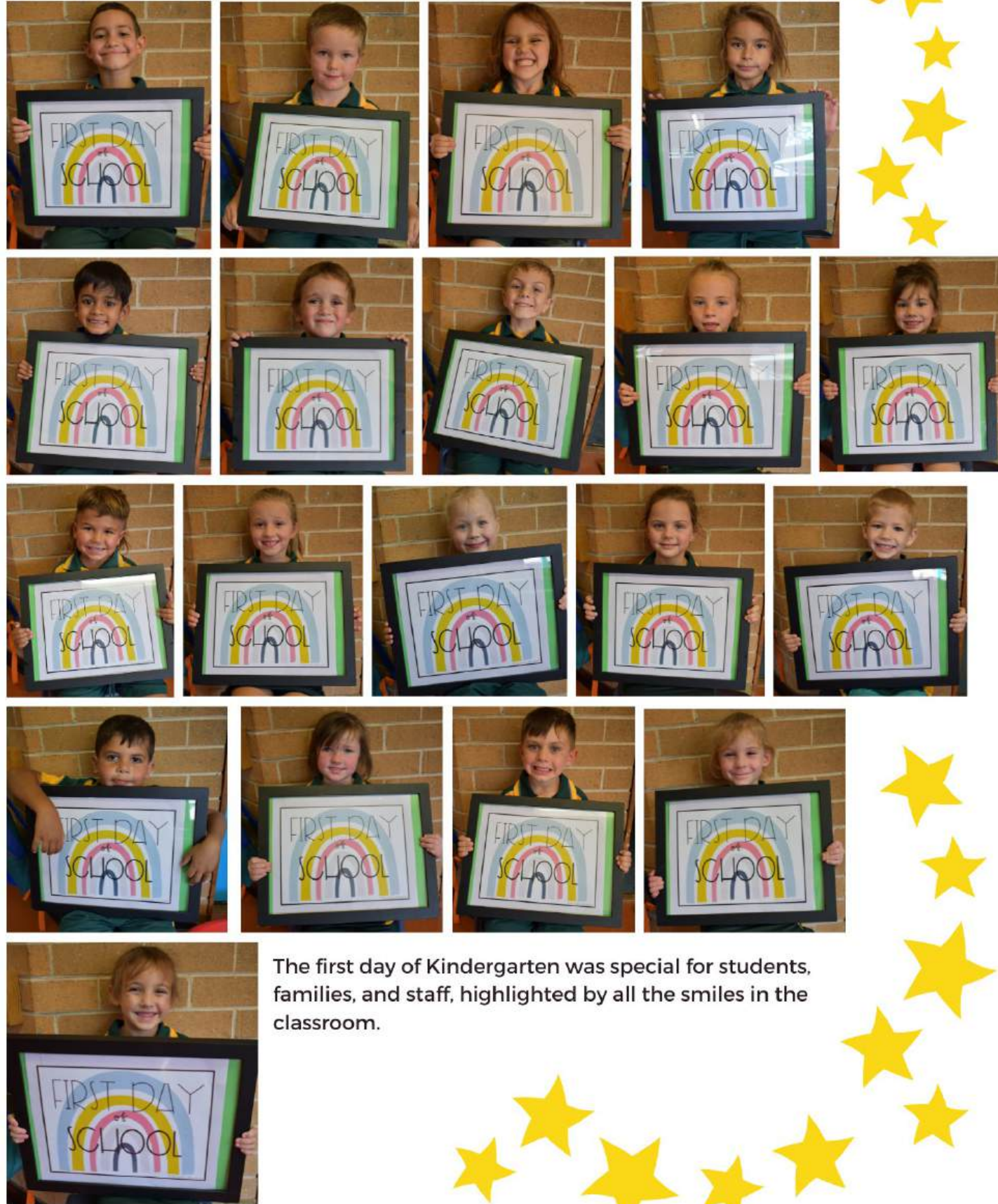
The first day of Kindergarten was special for students, families, and staff, highlighted by all the smiles in the classroom.