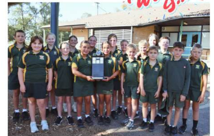
The WCS Gobondery/Narrarf swimming team have brought back the trophy.